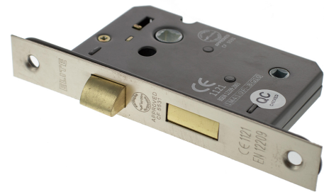
Product Finish Pictured: Satin Nickel (SN)